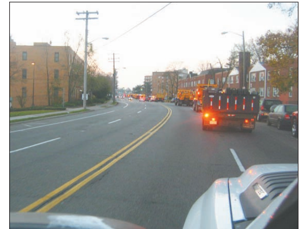
A police escort was provided to the City of Glen Cove Unit members as their convoy heads south to Long Beach to help with Sandy cleanup efforts. Workers packed one truck with parts to repair their vehicles on the fly if necessary and not waste any time.