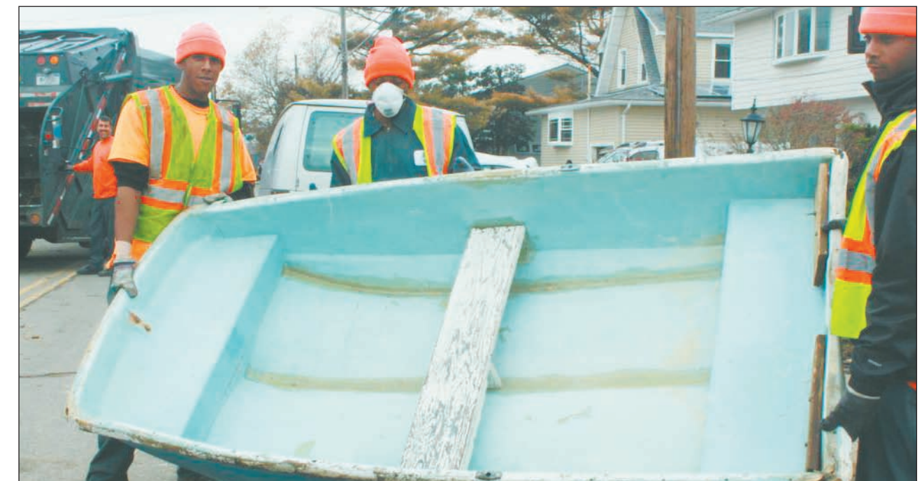
A dinghy represents the variety of debris Sanitary District No. 2 workers in Nassau County dealt with in Sandy cleanup. Coincidentally, CSEA members recently helped defeat a proposed dissolution of the district, saving 68 jobs and assuring uninterrupted delivery of public services during nature's worst.