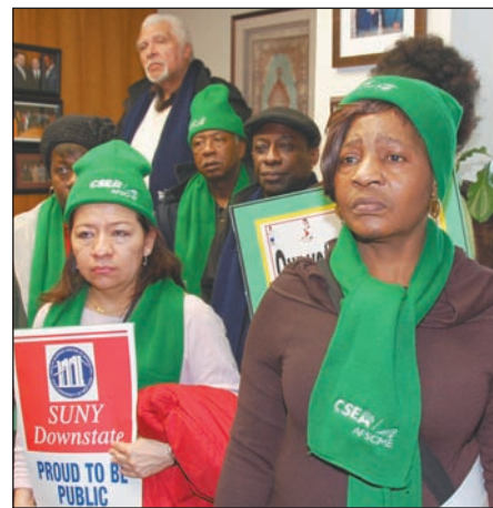
SUNY Downstate Local members lobby state legislators in their Albany offices.