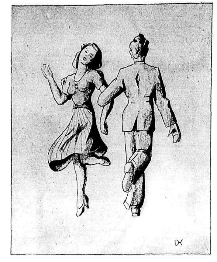
The Inconsiderate Jitterbug