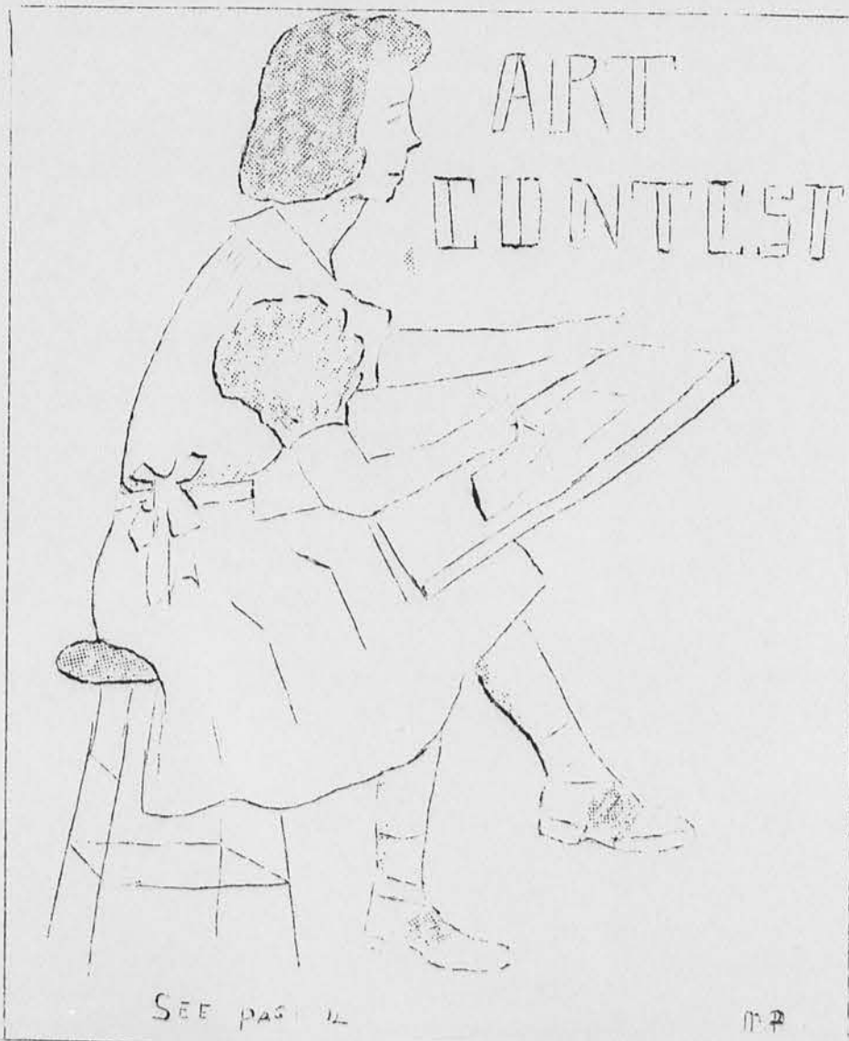
SEE PAGE 12