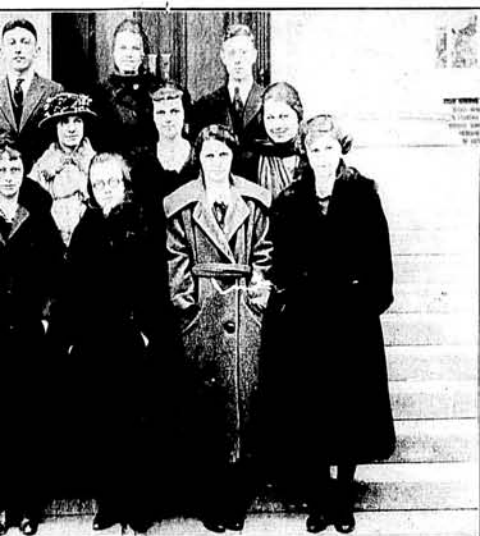
STUDENT VOLUNTEER GROUP