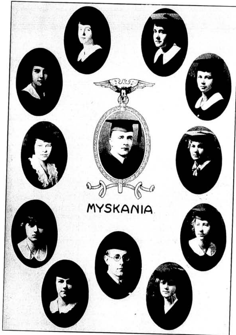
MYSKANIA - SENIOR HONORARY BODY