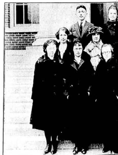
THE STUDENT VOLU