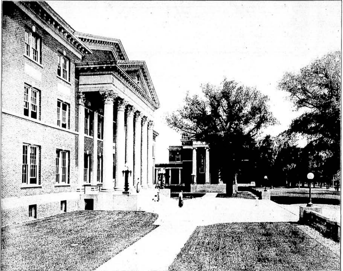
STATE COLLEGE, ALBANY, N. Y.