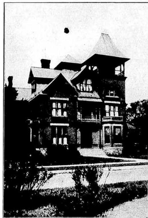
SYDDUN HALL--A DORMITORY