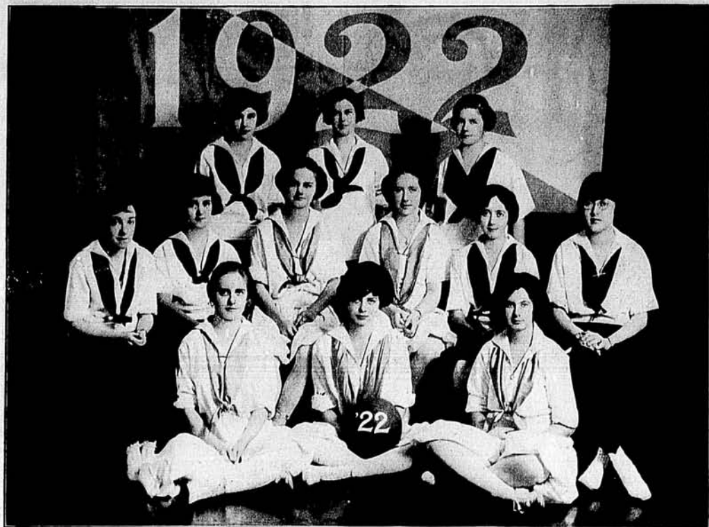
GIRL'S CHAMPIONSHIP BASKETBALL TEAM 1921-22 1922 Class Team