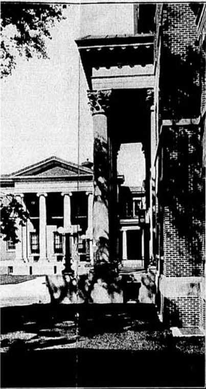
MORE OF STATE COLLEGE