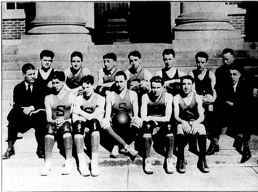
VARSITY BASKETBALL TEAM