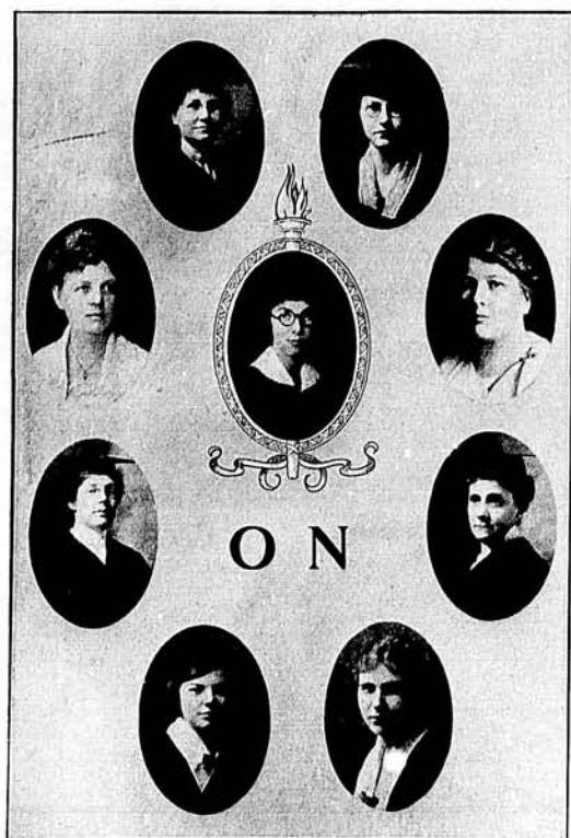
OMICRON NU Honorary Society of Home Economics Department