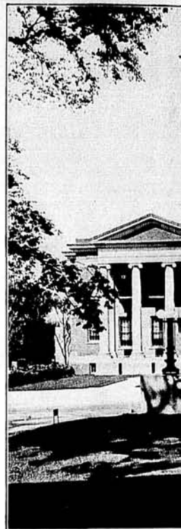
MORE OF ST.