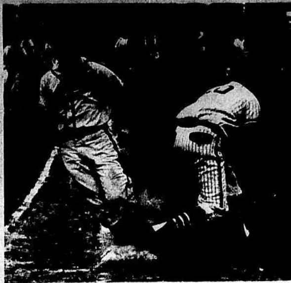
THE BASEBALL TEAM opened its season on a sour note with a single loss to Utica College and a double loss to Oswego.