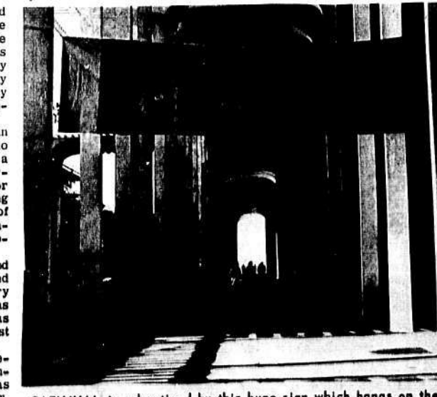
CARNIVAL is advertised by this huge sign which hangs on the podium in front of the Campus Center. Tickets are still available at the student information desk in the Campus Center from 11:30 - 3:30 daily.

The main reason for this declaration is that the membership in the Student Association is necessary for participation in any group financed in whole or in part by Student Association.