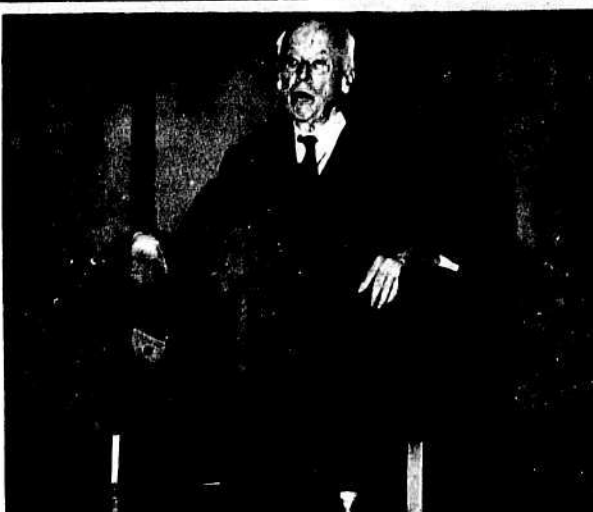
NORMAN THOMAS sat in a comfortable chair as he answered questions after he had delivered his speech about his memories of the past fifty years.