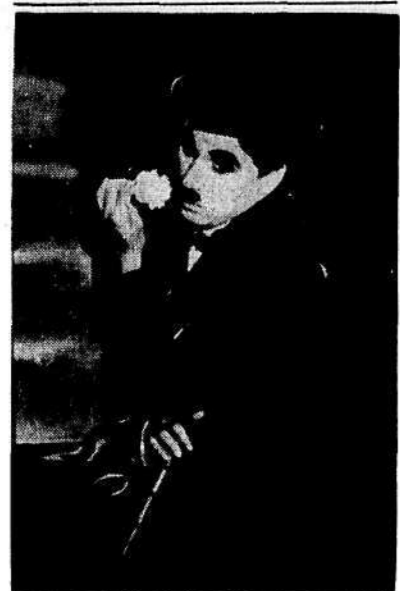
Charlie Chaplin, star of the film festival sponsored by International Film Group.

In December, "A Survey of Documentary" will include "Song of Ceylon," "Fare Laurent," "The River," "Screw Drivers and Screw Jays," and "Night Mail," with the poetry of W. H. Auden and the music of Benjamin Britten.