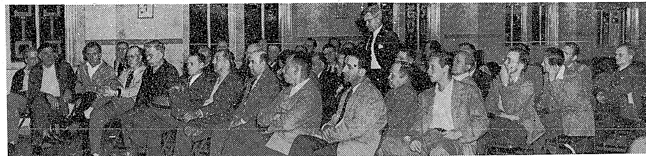
Meeting of representatives of major crafts at 301 Hall June 23 to plan joint steps in pressing for wage rate adjustments. See story on page