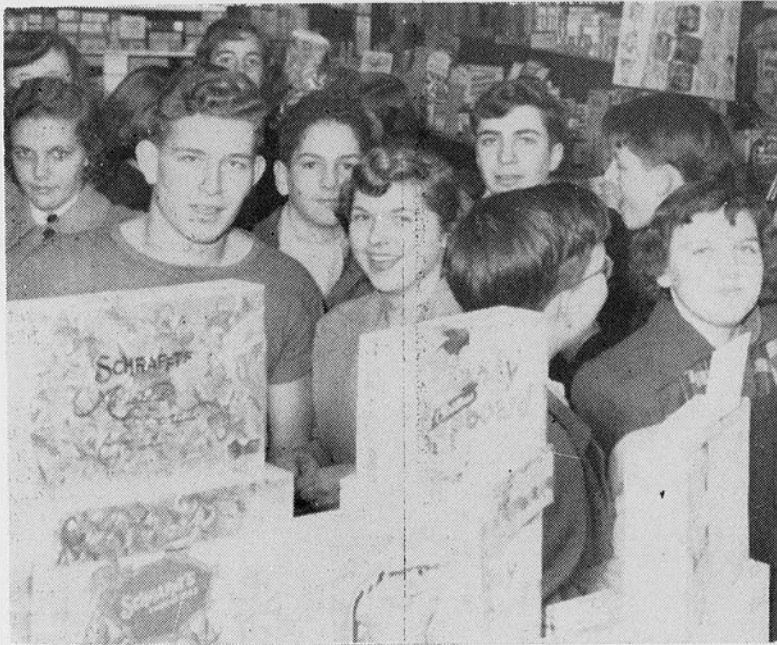
Hail, Hail the Gang's All Here