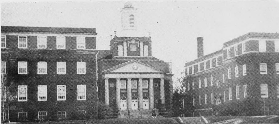
Our Hearts Ring Out to You