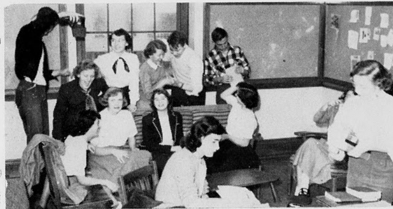
Sometimes I Wonder?