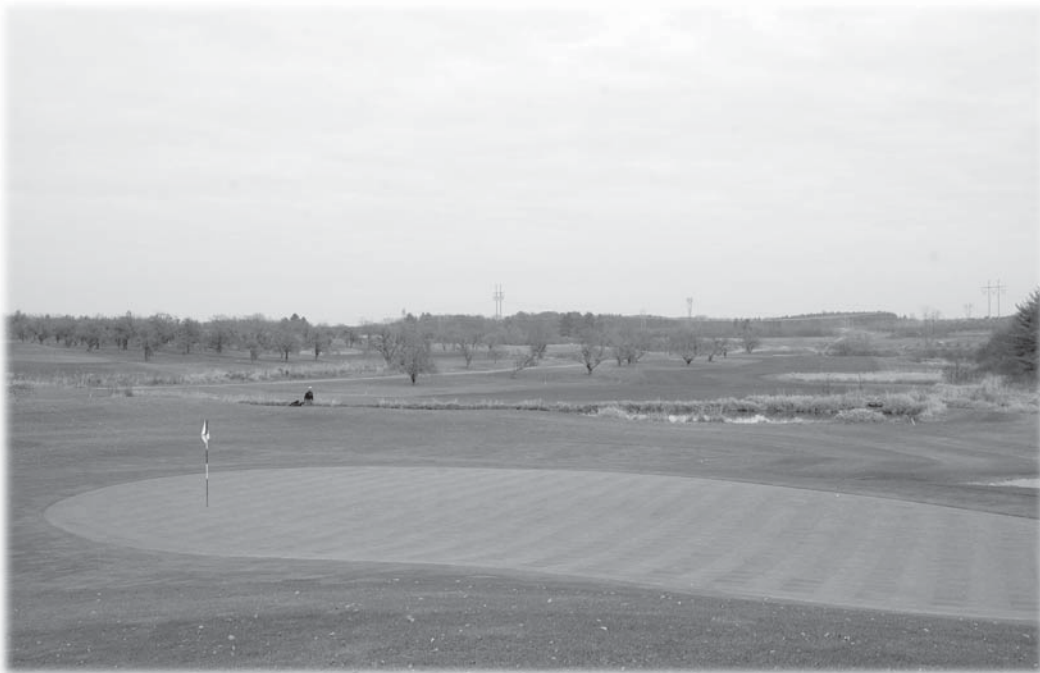
Orchard Creek Golf Club -- Site of the 2005 America East Golf Championships

^Orchard Creek Golf Club (Altamont, N.Y.)