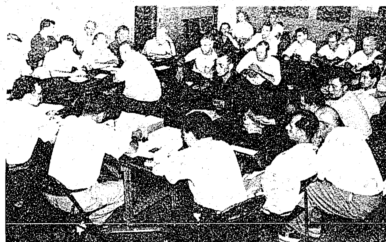
BOARD MEETING. UE Local 301's executive board is pictured above as it met this past Monday. The board mapped plans for a "mop up" organizing drive, and to help the UE Mica campaign.