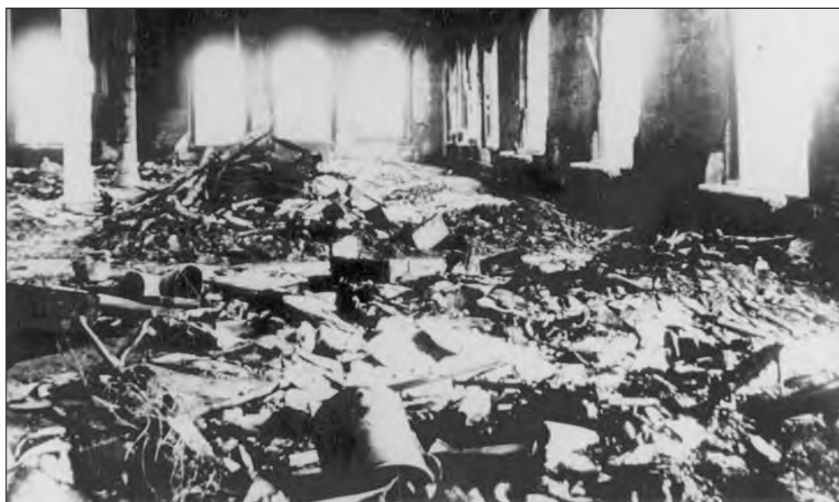
Top photo, firefighters try in vain to control the Triangle Shirtwaist factory fire. Below, one of the devastated factory production rooms.