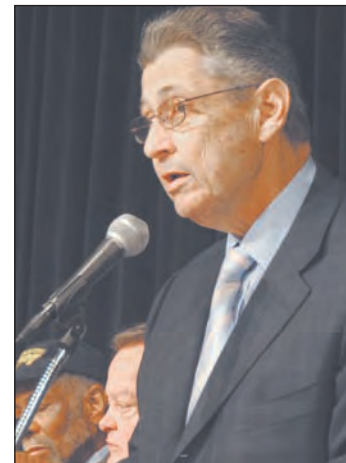
Right, Assembly Speaker Sheldon Silver addresses AFSCME members.