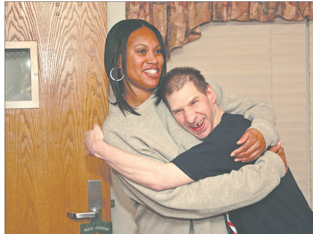
Quality care is what the system is all about.