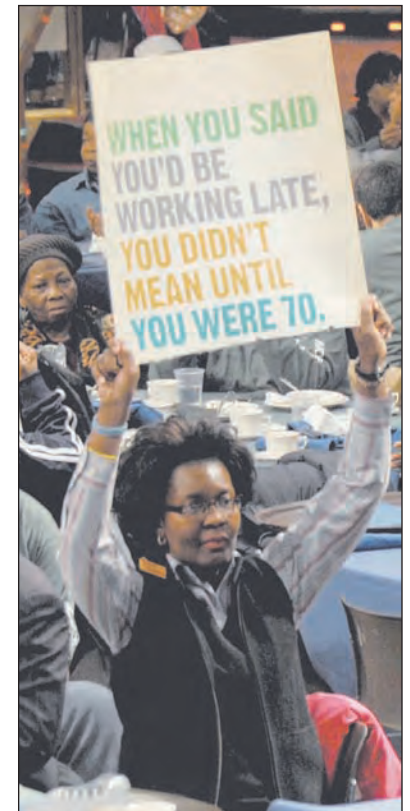
An AFSCME member makes her voice heard at the Lobby Day program.