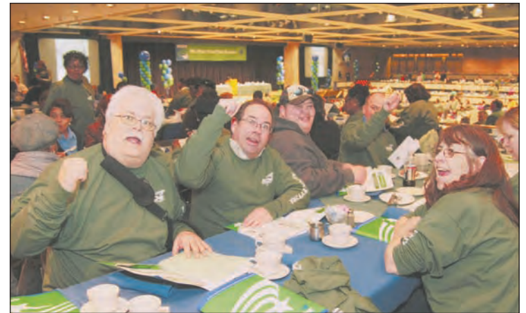
CSEA Central Region activists get fired up for AFSCME Lobby Day.

On the same day, CSEA members employed in libraries across the state met with their state lawmakers to urge them to support library funding and programs.