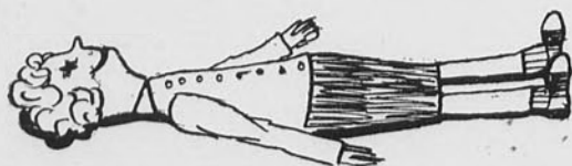
WHAT'S WRONG WITH HER? NO HOMEWORK!