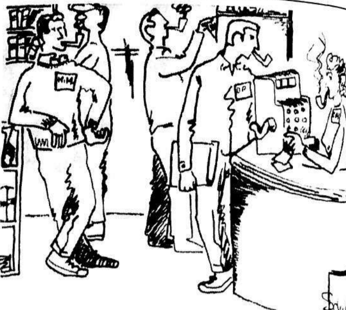
WELL, EVERYBODY'S DOING IT!

We would like to see the committee completely unaware of the situation. We would like to see the committee completely unaware of the situation. We would like to see the committee completely unaware of the situation.