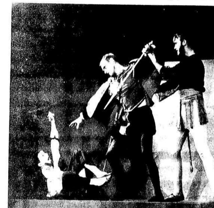
Othello cast rehearses dramatic scene.