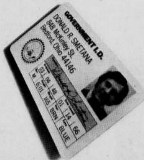
These rates do not apply to groups.

Holiday Inn 120 Main St. East Rochester, New York 14604 (716) 546-6400