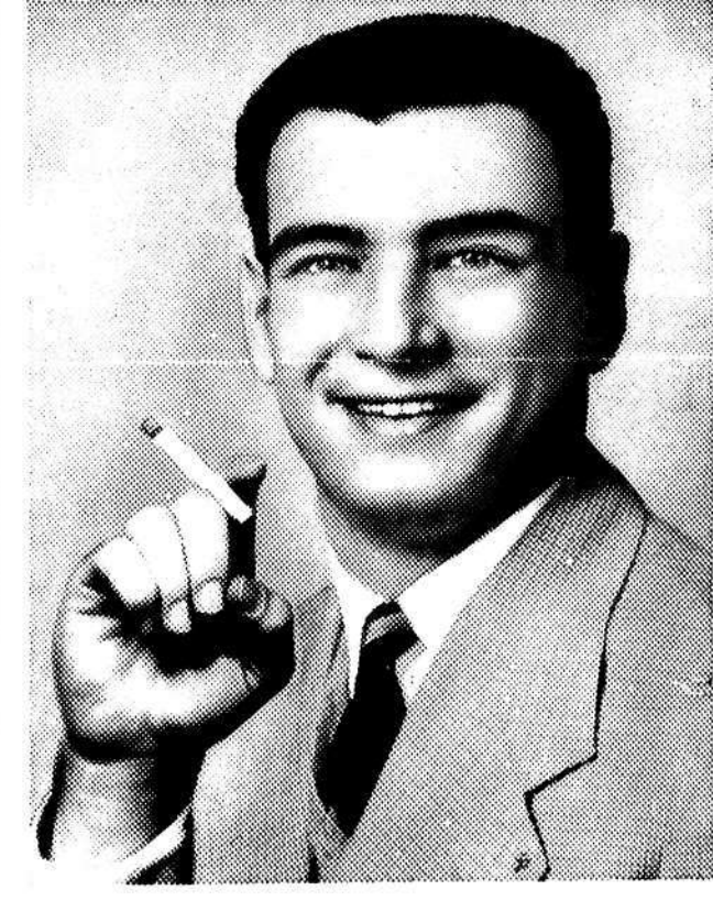
"Chesterfields for Me!" Univ. of Indiana '54

The cigarette with a proven good record with smokers. Here is the record. Bi-monthly examinations of a group of smokers show no adverse effects to nose, throat and sinuses from smoking Chesterfield.